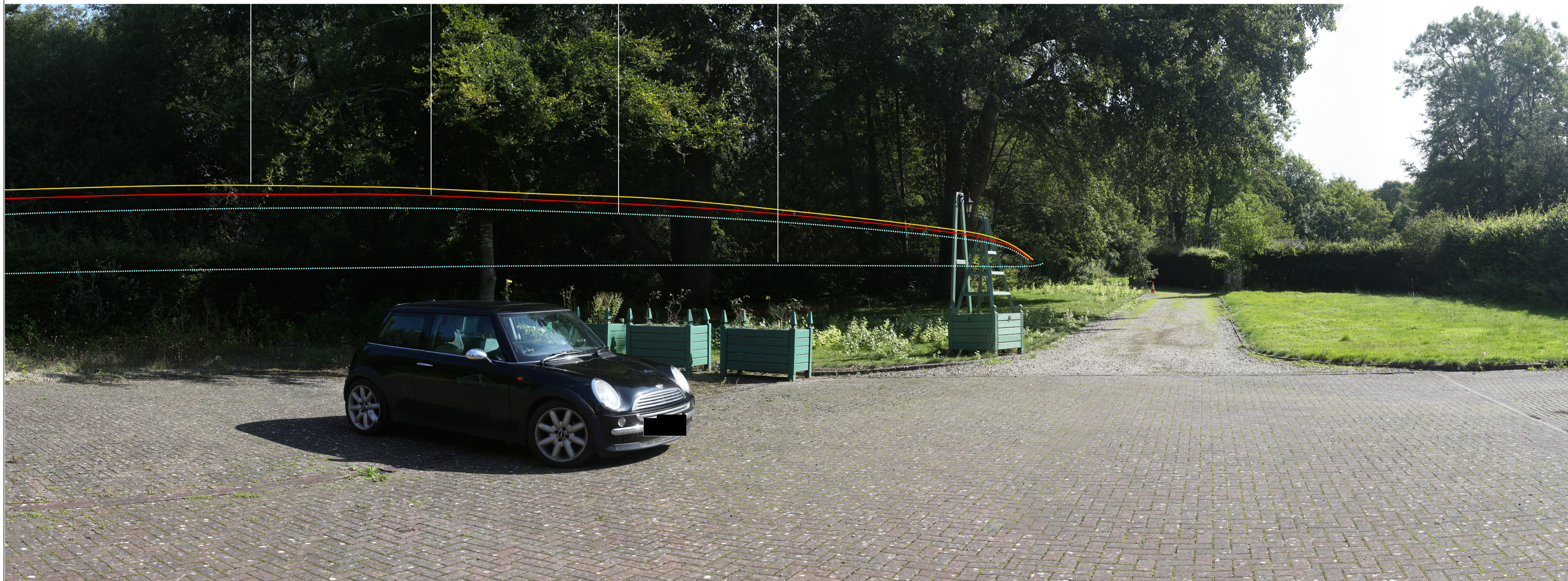
PROPOSED (SUMMER YEAR 15)

Lower blue dotted line indicates road level of slip road